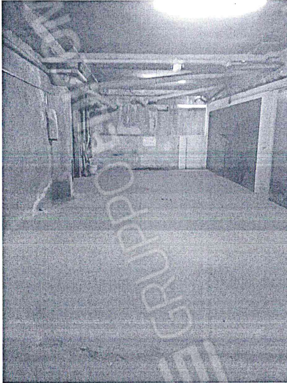
CORSELLO BOX AUTO