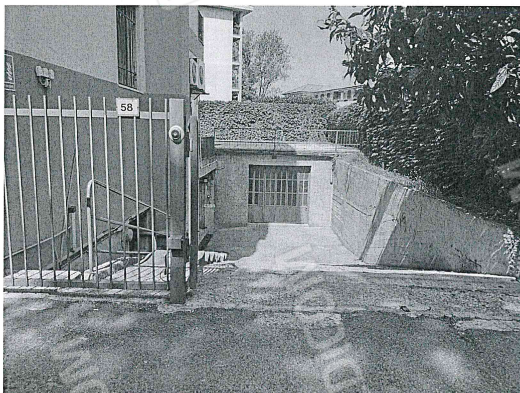
RAMPA D'ACCESSO CONDOMINIALE AL BOX AUTO SCALA B UNITA' N. 15